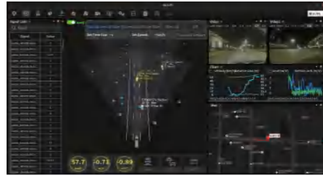
ACC evaluation interface