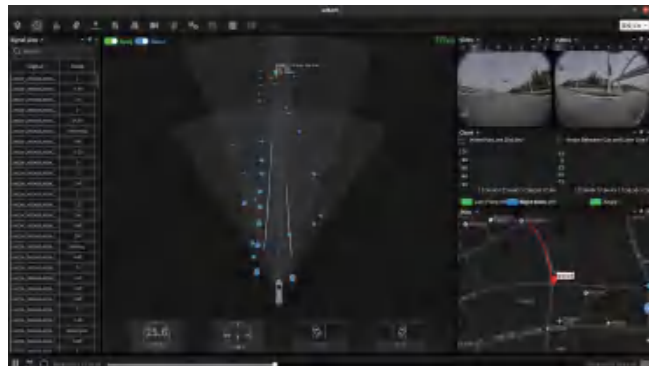
LDW/LKA evaluation interface