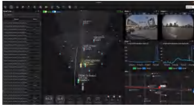
AEB/FCW evaluation interface